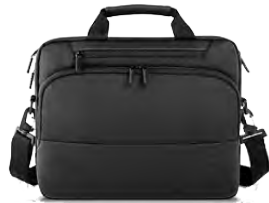
DELL PRO BRIEFCASE 14 /15 | PO1420C/PO1520C

Connect your Latitude to almost any device with a convenient 6-in-1 compact adapter.