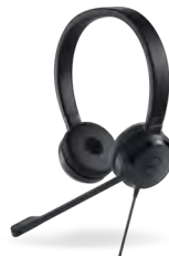
DELL PRO STEREO HEADSET | UC350

This space-saving stand, mounts up to two 27-inch monitors, providing the screen real estate you need to be most productive.