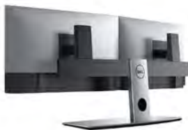
DELL DUAL MONITOR STAND | MDS19

Give your workspace a modern and clean appearance with a stylish wireless keyboard and mouse that perfectly complements your PC.