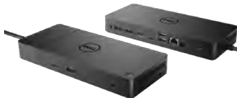
DELL THUNDERBOLT DOCK | WD19TB

Work at full speed with Dell's powerful Thunderbolt Dock. Charge your system faster, support up to three 4K displays and connect to your peripherals via a single cable.