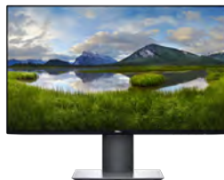
DELL ULTRASHARP 24 MONITOR | U2419H

Work at full speed with Dell's powerful Thunderbolt Dock. Charge your system faster, support up to three 4K displays and connect to your peripherals via a single cable.