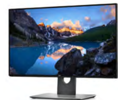
DELL ULTRASHARP 27 MONITOR | U2718Q

Hear every word clearly on your next call with the Dell Pro Stereo Headset, optimized to provide in-person call quality.